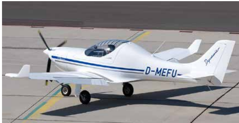
Fig. 5: Aircraft D-MEFU

The photo below shows the winglets, which match those found on the accident aircraft.