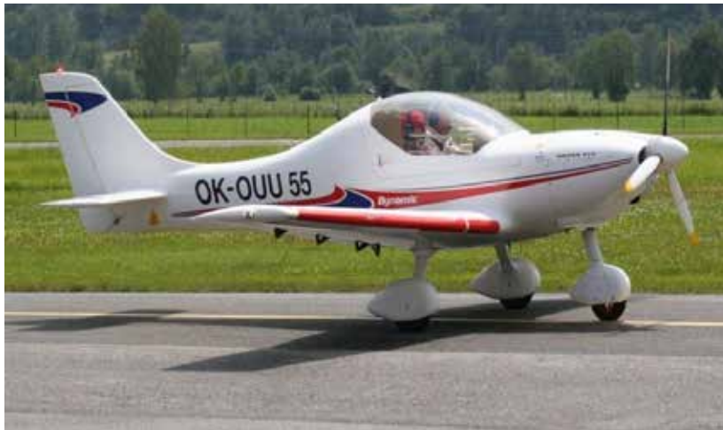
Fig. 4: Aircraft OK-OUU 55

The German police confirmed that this aircraft was at the aerodrome of Reidelbach (Germany), and also verified that this aircraft looked different from the one found in Valdecebro, both in terms of its color and the shape of the wings (specifically, the accident aircraft had winglets, and the one in Germany does not).