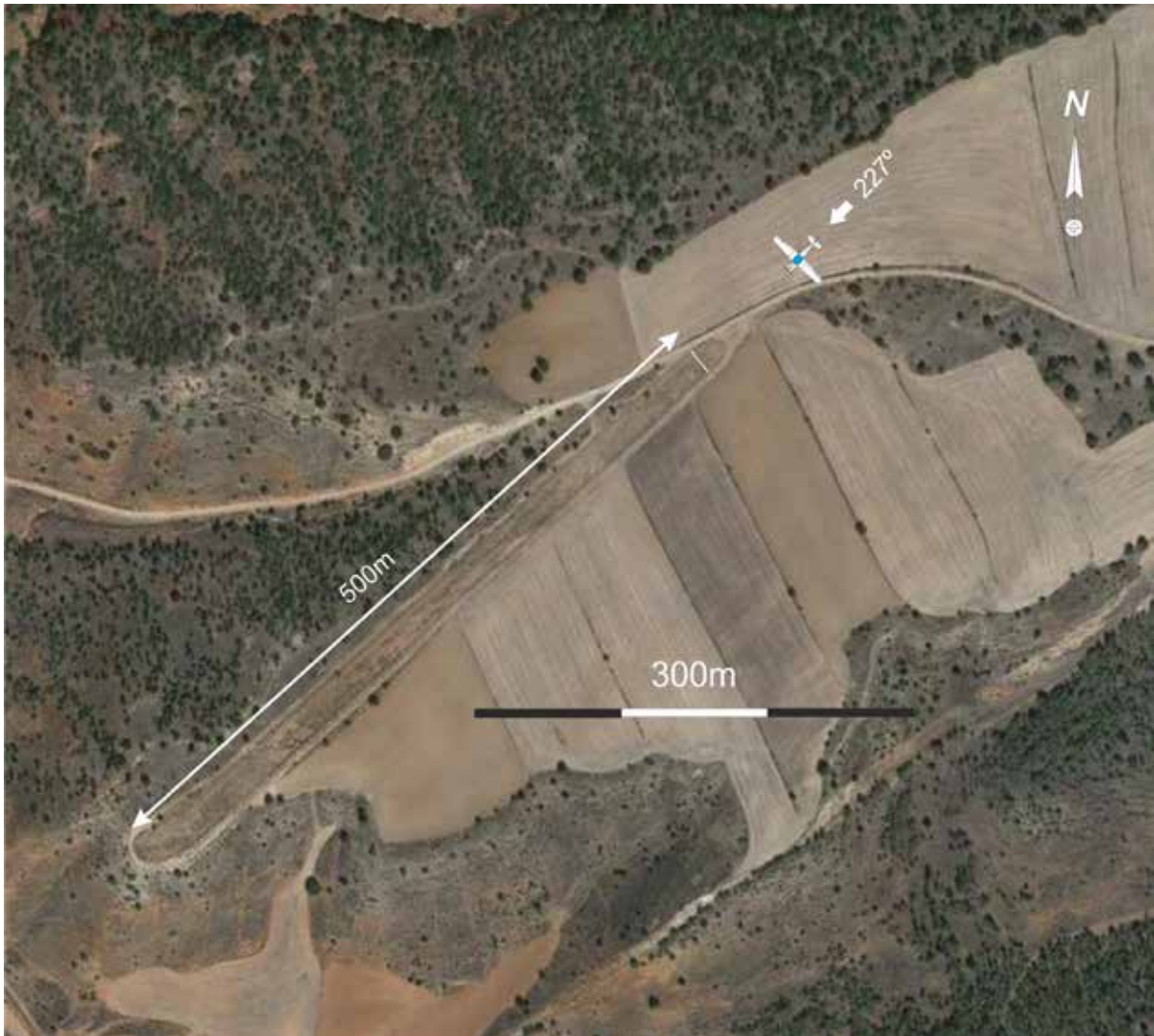
Fig. 2: Aerial image of the property and position and heading of the aircraft on its final approach