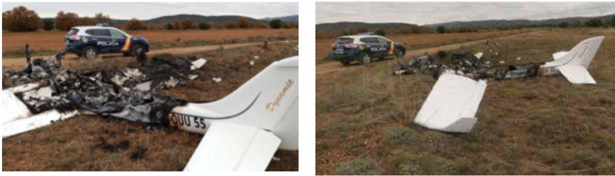
Fig. 1: Photographs of the aircraft after the accident

Both the aircraft wreckage and the surrounding area were searched for clues that could reveal the presence of any casualties, but none were found, nor were any biological remains of the potential occupants. No personal effects were found either.