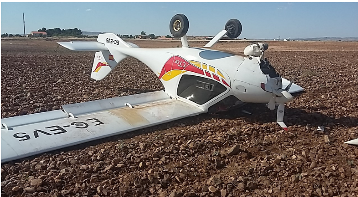
Figure 1. Condition of the aircraft

After applying the brakes, the aircraft exited the end of the runway and went into the adjacent field, which had recently been plowed. The ground was soft and the furrows were perpendicular to the runway heading. As a result, after traveling about 30 m, the nose gear collapsed, driving the propeller into the ground and causing the aircraft to flip over.