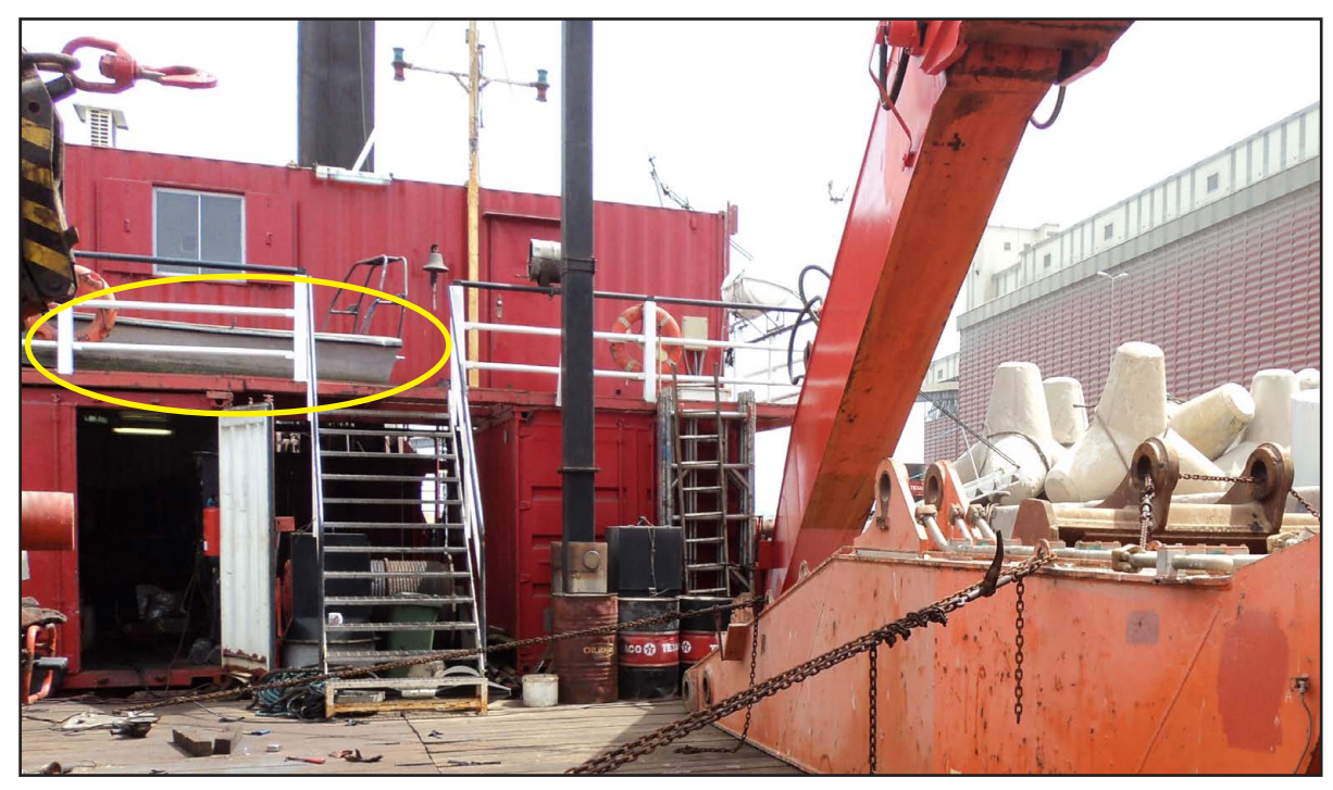
Figure 3: Tender stowed on Von Rock's deck

Between 1145 and 1215, the mate and the workboat's two engineer ratings shortened the towline between GPS Battler and Von Rocks . Shortly afterwards, the workboat's crane lifted the tender from the dredger onto GPS Battler 's deck, where it was examined by the mate. The mate checked that there were no obvious defects and that there was sufficient fuel for the trip to the shore and back.