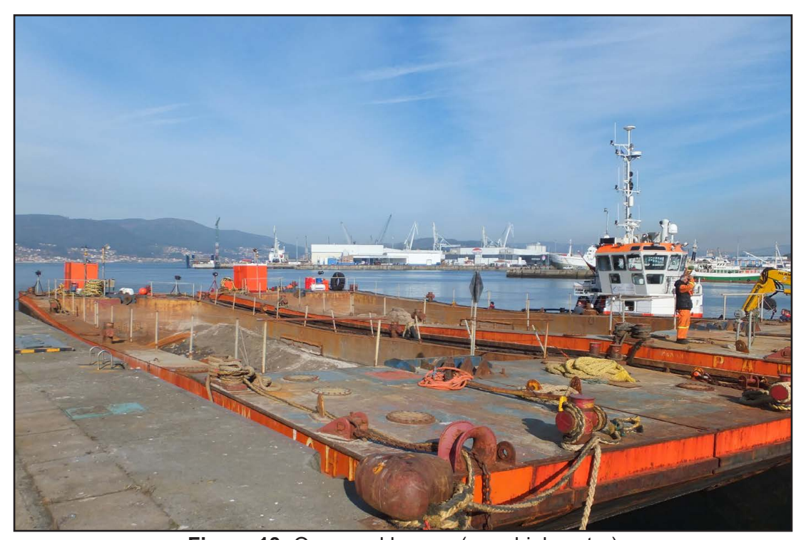
Figure 13: Quay and barges (near high water)

The means of access from the quay to the inner barge depended on the height of tide. The tidal range at spring tides was 3m. Around high water, the levels of the quay edge and the inner barge's deck were sufficiently close to enable a person to step up or down from the quay to the deck (Figure 13). Towards low water, the barge's deck was approximately 2.5m below the quay edge and so access was via a fixed vertical ladder fixed to the quay wall (Figure 8).