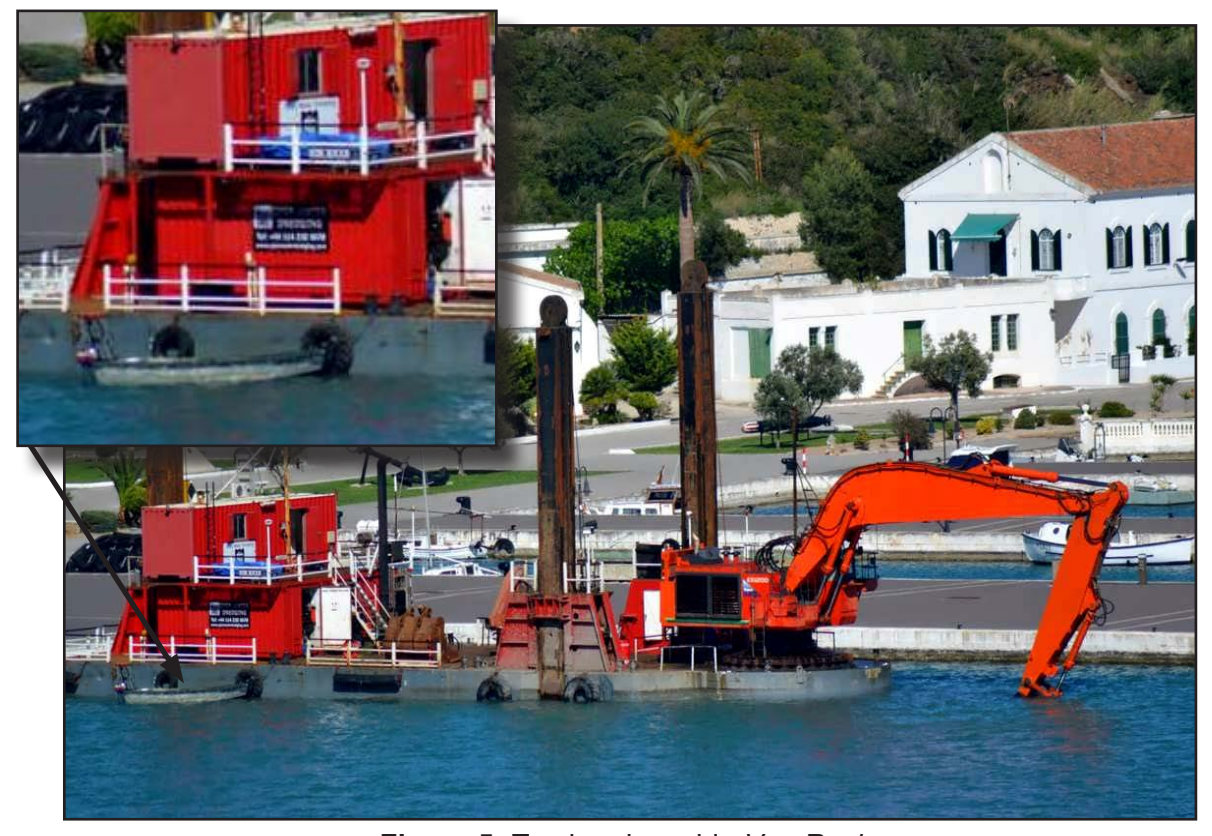
Figure 5: Tender alongside Von Rocks

The tender was used by the dredger's crew during dredging operations to transfer crew short distances to and from the shore, usually when the dredger was working within harbour limits ( Figures 5 and 6 ). It was also used by the dredger's crew to access and maintain some of the dredger's deck equipment. GPS Battler 's crew had not been authorised to use the tender.