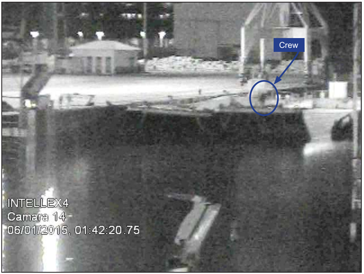
Figure 12: Still from CCTV at 0142 - crew searching for the mate

water using a rope, a boat hook and grapples. However, they were unable to catch hold of him due to the barge's freeboard, which was 3m above the waterline. A life-ring and line were available but were not used as the mate was unresponsive.