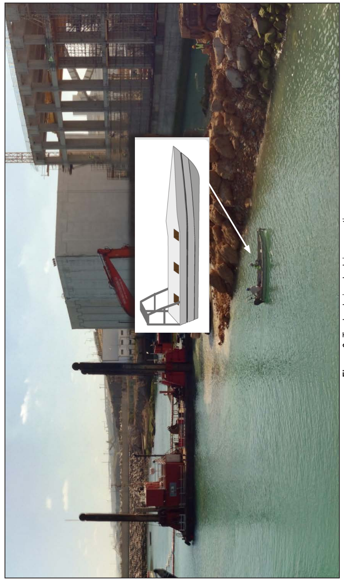
Figure 6: Tender during dredging operations