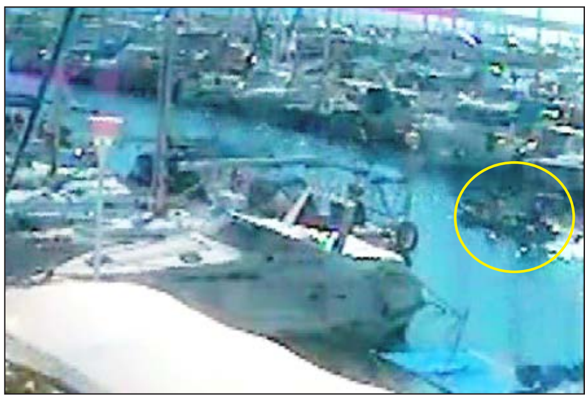
Figure 4: Still from CCTV at 1805 - tender leaving the marina

At 1803, the master assessed that the sea conditions had improved slightly, so he and the mate made their way to the tender in order to return to GPS Battler . The master was hungry and tired and he wanted to return on board before it became dark<sup>4</sup>. At 1805, the mate steered the tender out of the marina; the master was sitting towards the bow with the mate at the helm (Figure 4).