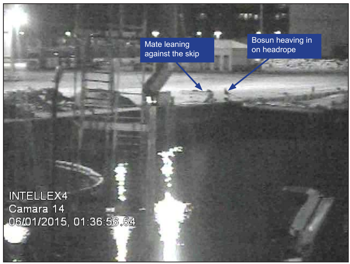
Figure 10: Still from CCTV at 0137 - bosun heaving in on headrope