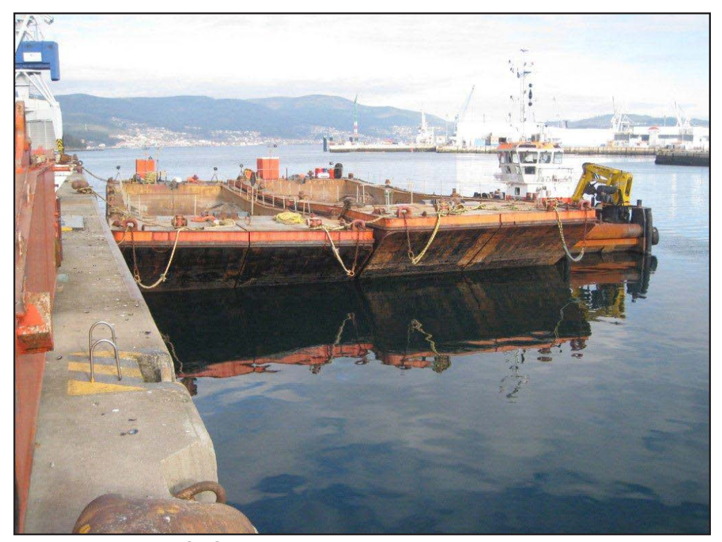
Figure 7: GPS Battler and barges moored alongside in Marin

At 2110<sup>9</sup> on 5 January 2015, the mate arrived at berth No.0 on the New Commercial Pier in Marin, Spain to join GPS Battler , which was moored outboard of two split hopper barges ( Figure 7 ). The workboat's master and bosun were also scheduled to re-join the vessel on the same evening.