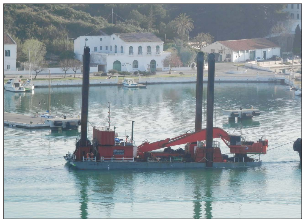
Figure 1: Von Rocks

GPS Battler sailed from Mahon, Menorca with the unmanned dredger Von Rocks (Figure 1) in tow on 6 August 2014 for passage to Marin on the north coast of Spain. The workboat was expected to complete the 1040 mile voyage before 3 September. No stops were planned.