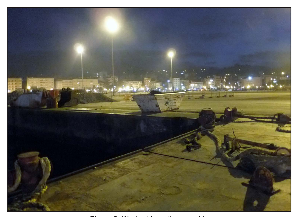
Figure 9: Waste skip on the quayside

recordings indicate that the mate was unsteady on his feet<sup>10</sup>. He did not attempt to board the workboat and remained standing beside a waste skip close to the quay edge (Figure 9 and 10).