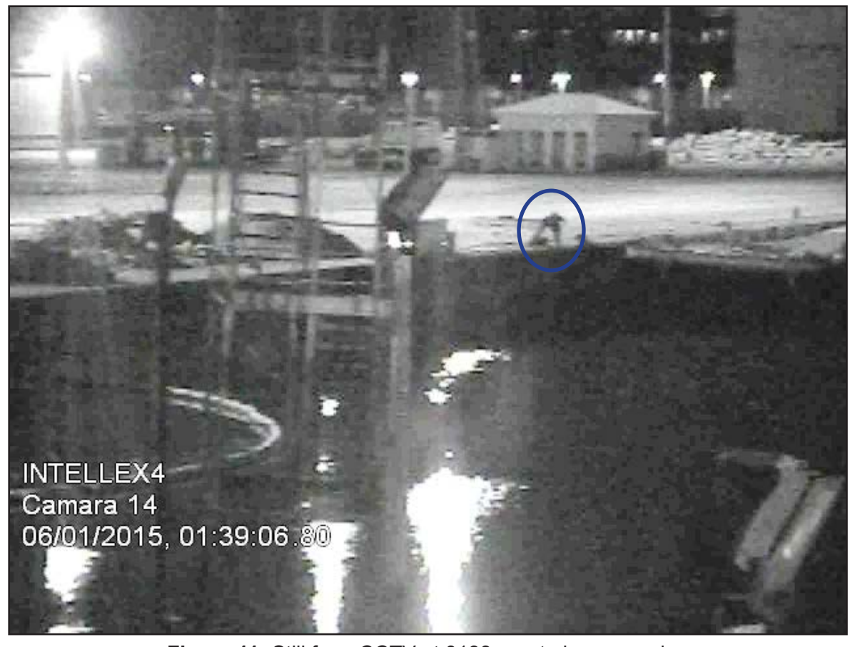
Figure 11: Still from CCTV at 0139 - mate by quay edge