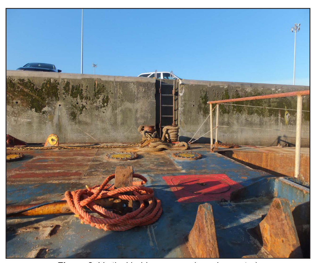
Figure 8: Vertical ladder on quay (near low water)

The mate shouted towards the workboat to attract the attention of the crew on board because he was not comfortable trying to access the vessel without assistance. It was dark, he was carrying a bag weighing 18kg and, as it was close to low water, access to the deck of the inner barge required a 2m descent of a vertical ladder fixed to the quay wall (Figure 8). No one responded to the mate's shout, and he had no means of contacting the crew on board as he did not have the workboat's mobile telephone number.