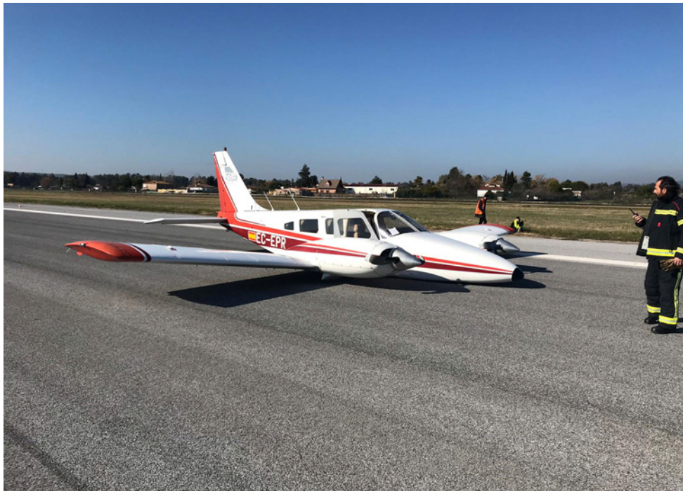
Fig. 2 – Condition of the aircraft

The aircraft sustained damage to its propeller and the underside of its fuselage.