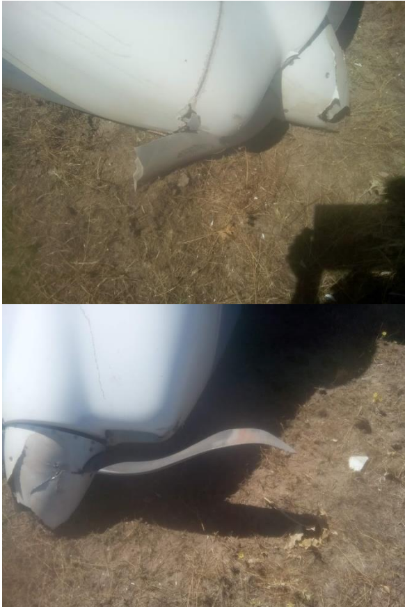
Fig. no. 3 - Detail of the damage to the aircraft

After touching down on the runway, the aircraft rebounded into the air, following a curved trajectory to the left. After passing the aerodrome perimeter fence, it travelled for 12.7 m before returning to the ground, making initial contact with its left main landing gear wheel.