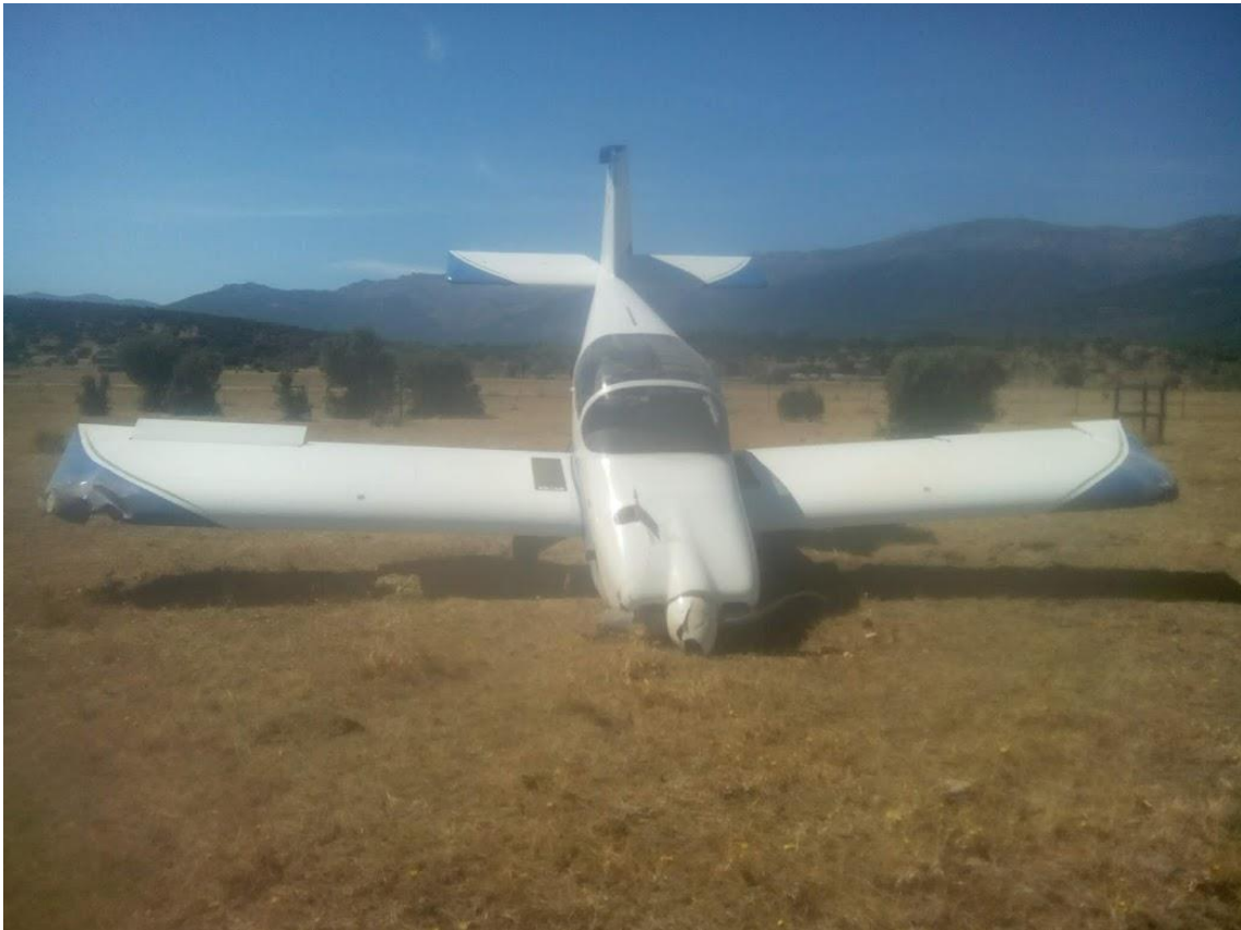
Fig. no. 2 - Aircraft in its final position

The pilot was unharmed and the passenger suffered minor injuries. The aircraft sustained damage to its fuselage, wings, landing gear, propeller and engine.