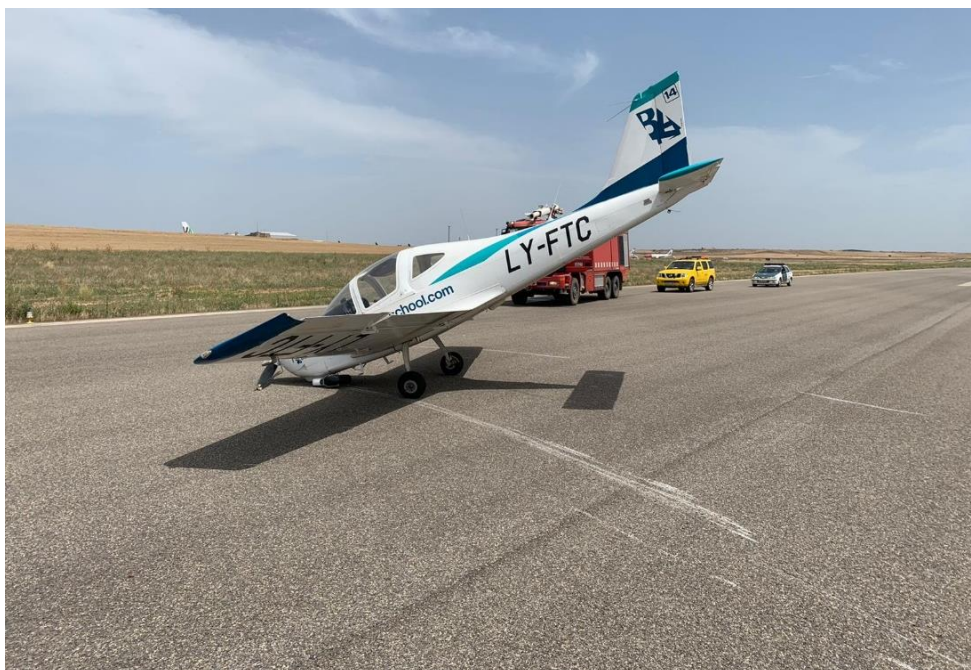
Fig. 1: Lateral view of the aircraft after the accident

The student pilot was unharmed and was able to exit the aircraft without assistance. The aircraft sustained significant damage.