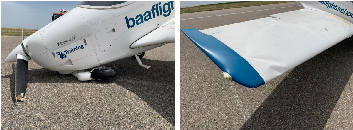
Figs. 2 & 3: Damage to the front of the aircraft and the tip of the right wing