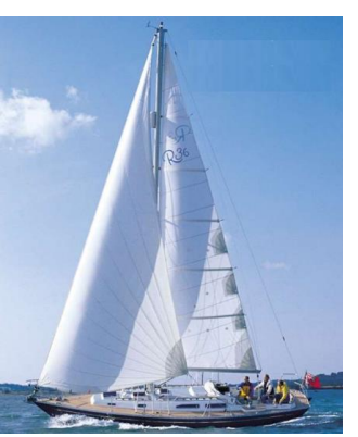
Figura 2. Rustler 36, model of the recreational sailing vessel CLEM