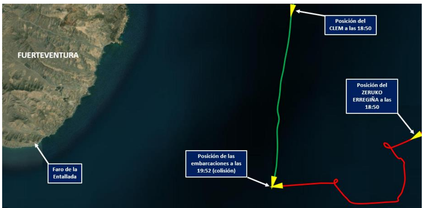
Figura 5. Courses followed by the fishing vessel ZERUKO ERREGIÑA (in red) and the recreational vessel CLEM (in green) since one hour before the accident. (Special data infrastructure viewer of the Hydrographic Institution of the Spanish Navy)

The prow of the fishing vessel collided with the port side of the sailing vessel, causing structural damage and leading to a significant leakage. On seeing how the area of his boat under the waterline was being inundated, the skipper of the CLEM asked the crew of the fishing vessel for help. The crew members threw a rope to the skipper of the CLEM, who attached it to a cleat hitch.