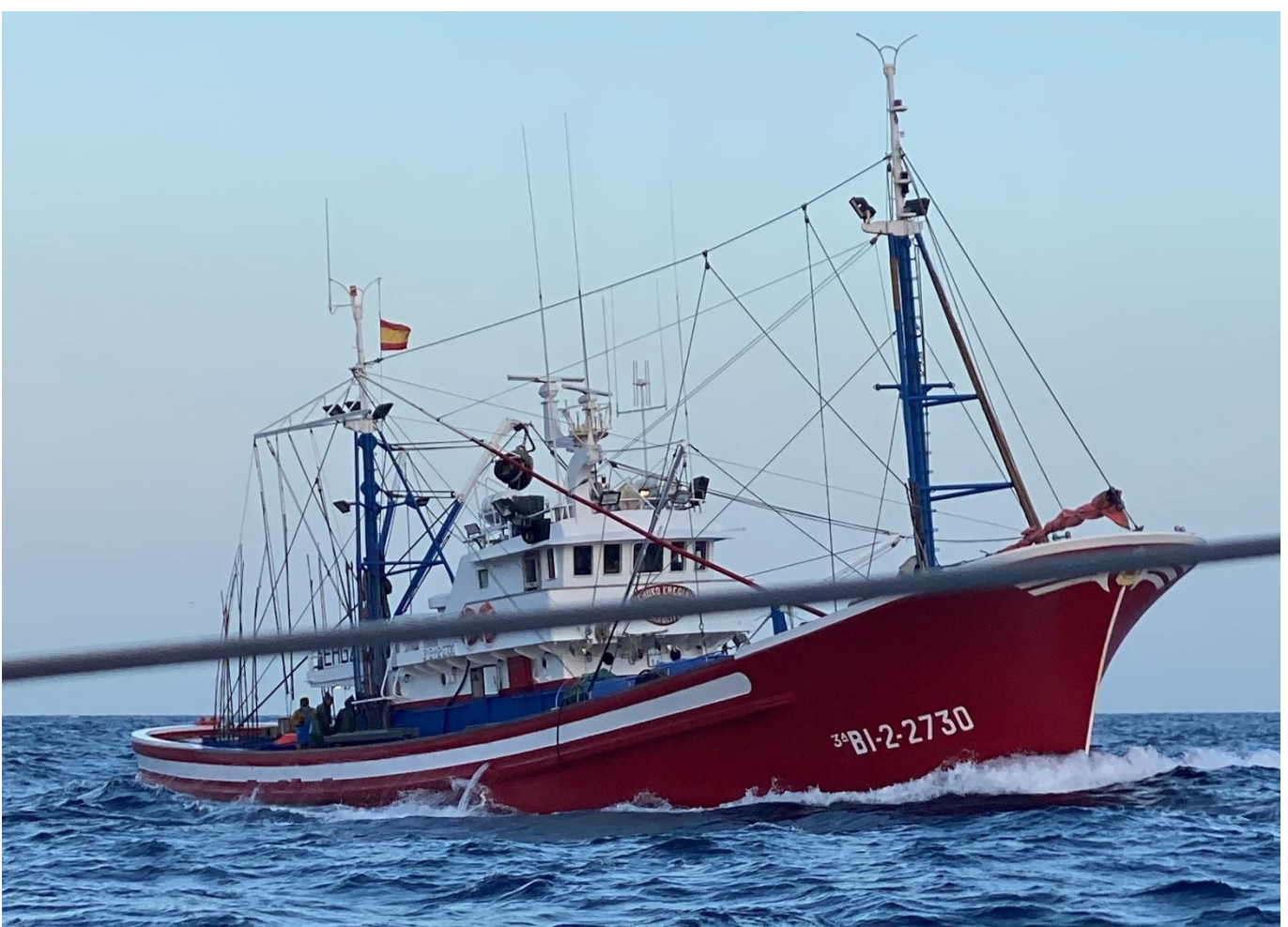
Figura 8. Photograph of the fishing vessel ZERUKO ERREGIÑA taken by the skipper of the CLEM just before the accident

Collision between the fishing vessel ZERUKO ERREGIÑA and the recreational vessel CLEM 6 miles east of the port of Arrecife (Lanzarote), on March 30, 2022