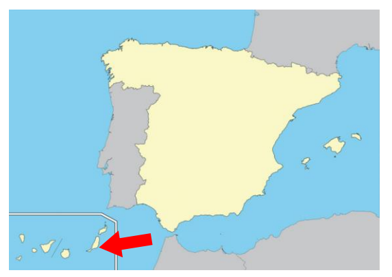
Figura 3. Accident site