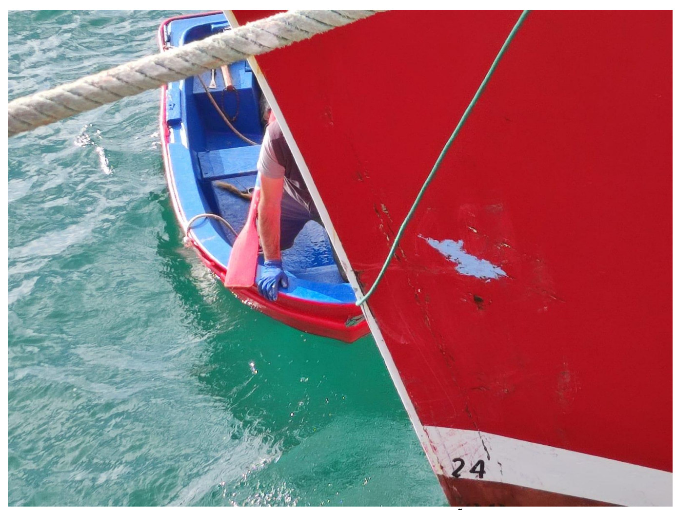
Figura 6. Close-up of the damage suffered by the ZERUKO ERREGIÑA during the accident