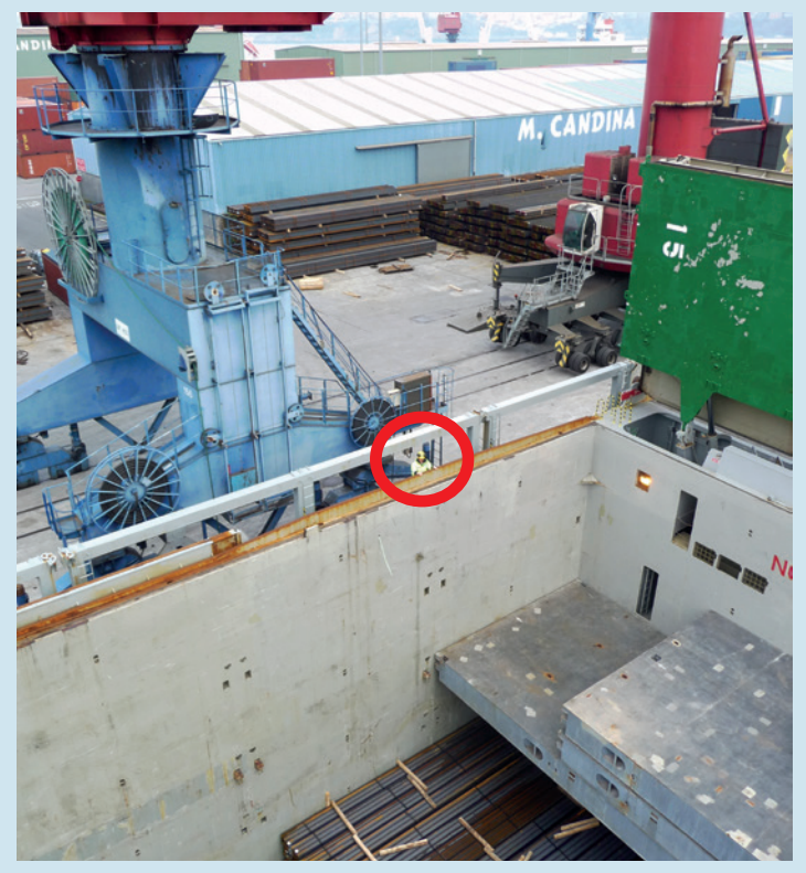
Simulated position of the chief officer from the cranedriver's position.